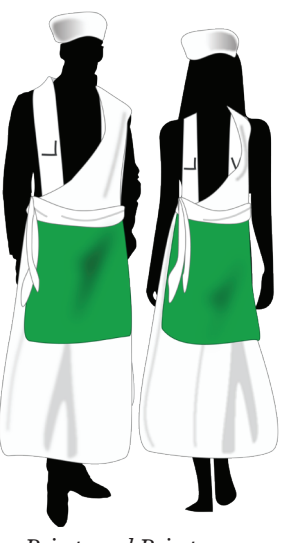
Priests and Priestesses